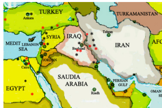
Fig 3. Map of sampling situations (approximately) Red stars (*) show collecting zone of Triticum persicum and Black stars (*) for Triticum pyramidale

than persicum species (Tables 4 and 5). The glutenin subunits of these species were also examined and the similar variation in the grain quality was seen (Kharabian, 2005). This result probably is due to relationship between two species and centre of diversity.